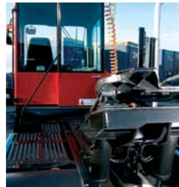
Two double-acting hydraulic cylinders for faster trailer lifting and lowering.

The TT612d distribution tractor's strength, high-quality design and common components guarantee maximum uptime and keep distribution centre operations on the move. With long lifetime expectancy, this tractor has been built to perform even in the harshest conditions. Busy distribution centres and depots are no place for lightweights, so the Kalmar distribution tractor boasts the strongest frame in the industry.