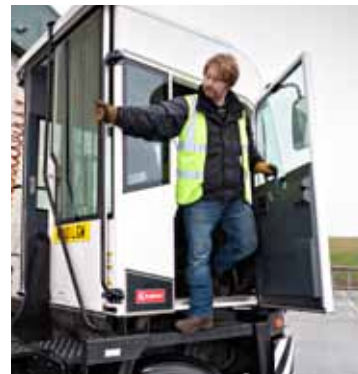
Side door can also serve as an extra exit point improving safety and usability.

The Kalmar TT612d offers superior manoeuvrability in restricted spaces with the smallest turning radius of any distribution tractor – only six metres. Steering is easy, precise and rapid. The hydraulic system provides fast lifting and lowering of the fifth wheel without the need for the driver to leave the vehicle to raise or drop the trailer's landing gear.