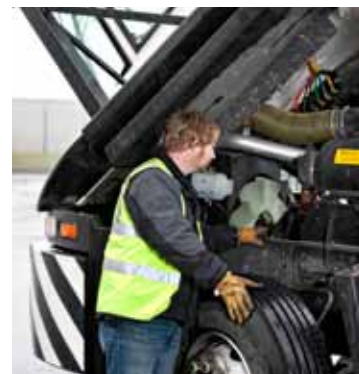
The cabin can be lifted electrically for easy access to engine compartment.