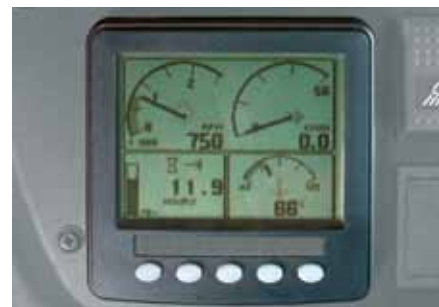
Multi-functional display: all data available at a glance including diagnostics information.