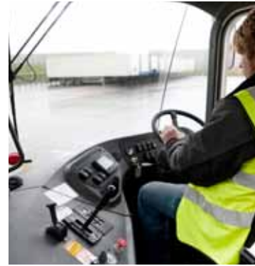
Large windows and angled corners without A-pillars provide excellent all-round visibility.

The TT612d's cab is spacious and comfortable with excellent headroom and legroom. The driving environment has been carefully designed, with all controls conveniently placed and visibility improved in what is also a very quiet cabin.