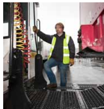
Wide stairways, sturdy handles and even rear deck increase productivity and safety.