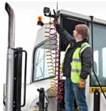
Tall cabin with functional rear doorway – only one low step to rear deck.