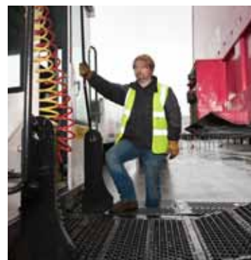
Wide stairways, sturdy handles and even rear deck increase productivity and safety.