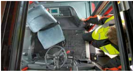
For safer entry, the doorway is free from obstacles.